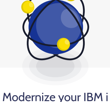
support business demands and growth

API extends your IBM i investment runway