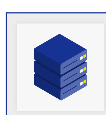
modernize legacy systems