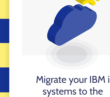
in an OpEx model