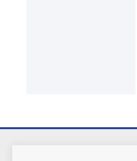
Lack of resources to accelerate innovation