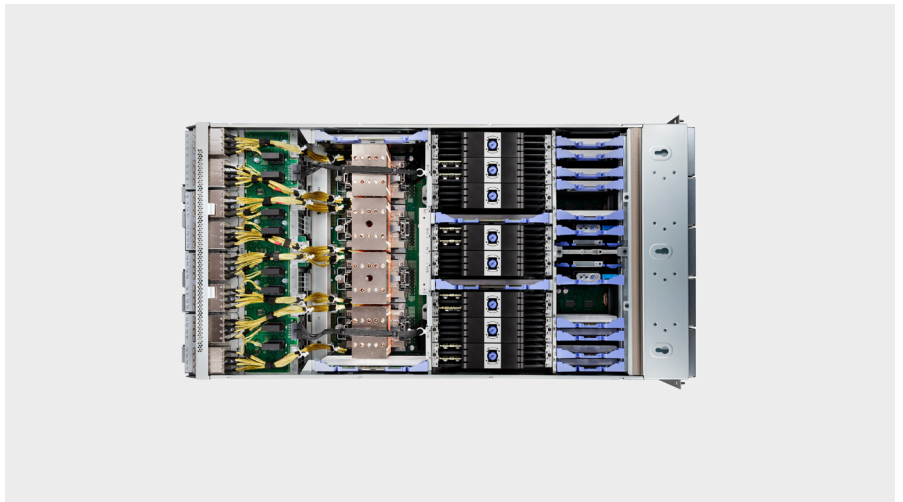
IBM Power E1080

Learn more about SAP HANA on IBM Power →